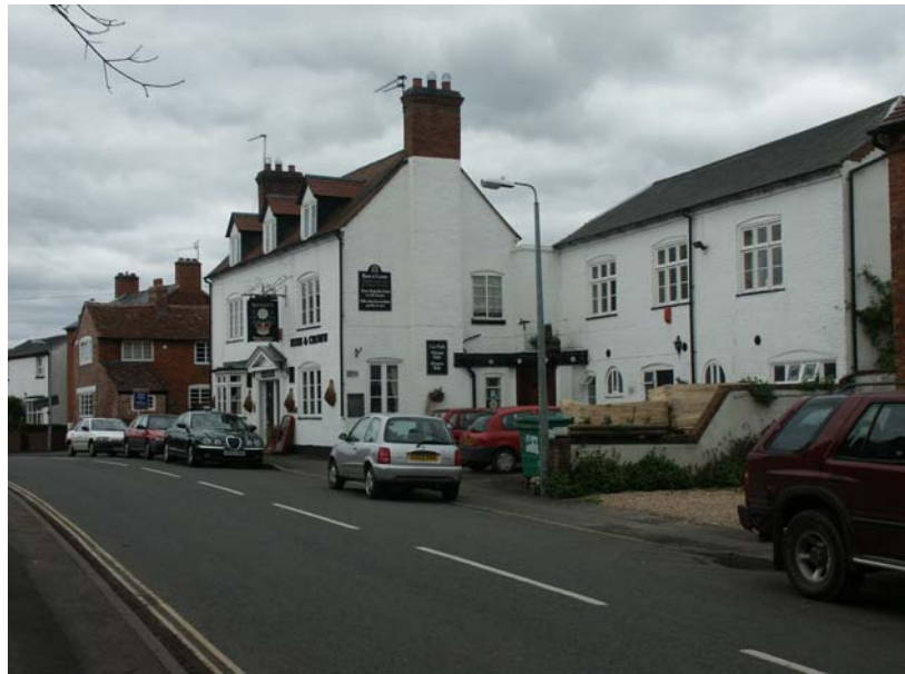
Rose and Crown